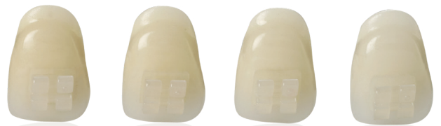
Brackets represented with no color enhancement.

Meet the rising demand for aesthetic orthodontics and capitalize on a growing adult market with InVu Aesthetic Brackets. Their virtually flawless finish and small size makes them the most beautiful ceramic brackets you can find. InVu Aesthetic Brackets feature Personalized Color-Matching Technology. Brackets absorb wavelengths of light so only the natural tooth color shows.