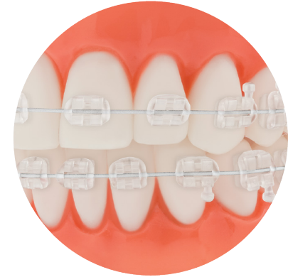
ClearVu® Mini Brackets Roth or MBT