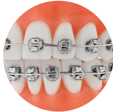
Tip-Edge Metal Brackets