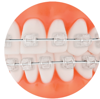
Tip-Edge® PLUS Aesthetic Brackets

Virtually Invisible Flexible Polymer Base True-Twin Design Pre-Coated Easy Debonding Multiple Ligation Options