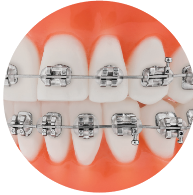
Nu-Edge Twin Brackets