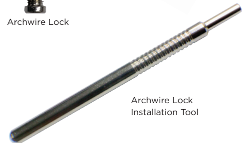
Archwire Lock Installation Tool