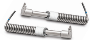
Left / Right Component