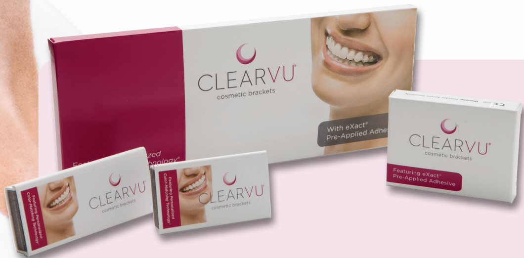
The model shown is wearing unretouched ClearVu Cosmetic Brackets featuring Personalized Color-Matching Technology .