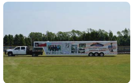
The American Veterans Traveling Tribute honors veterans with a traveling version of the Vietnam Wall and other memorials.