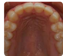
Final Occlusal Photo, Maxillary Dentition