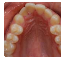
Initial Occlusal Photo, Maxillary Dentition