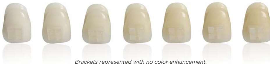
Brackets represented with no color enhancement.

With Personalized Color-Matching Technology , ClearVu Cosmetic Brackets match virtually any tooth shade.