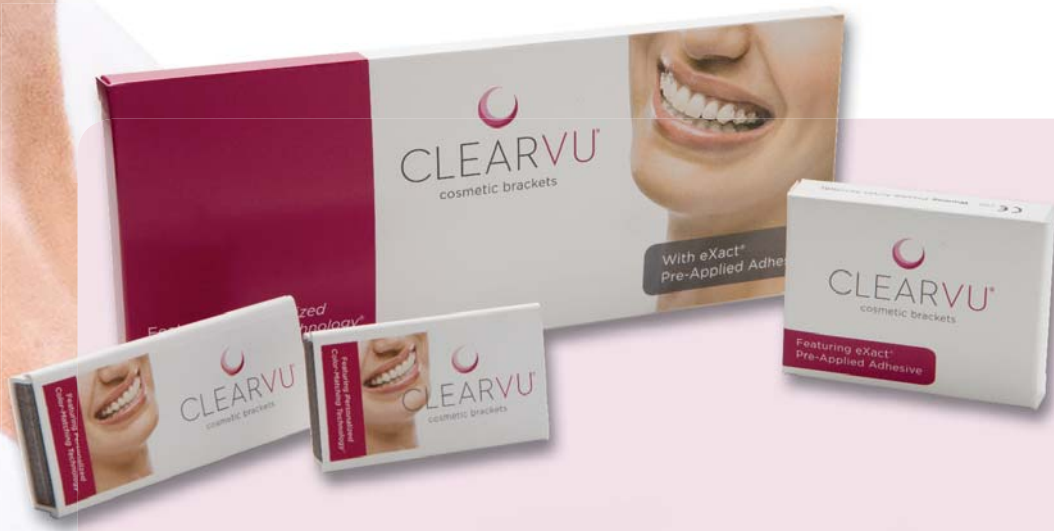
The model shown is wearing unretouched ClearVu Cosmetic Brackets featuring Personalized Color-Matching Technology .