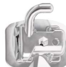
Second Molar Tube with offset