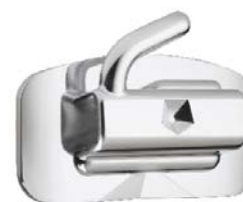
First Molar Tube without offset