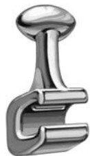
Figure 2. Ribbed crimpable hook

Ribbed Crimpable Hooks (Fig. 2) feature a tiny rib on the inner surface that locks onto the archwire when placed. These “stay put” hooks attach securely and accept force loads nearly equal to a welded hook. These hooks work best on .016” x .016” through .022” x .028” wire.