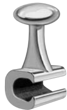
Figure 1. Tungsten carbide coated crimpable hook

A tungsten carbide inner coating (Fig. 1) prevents Coated Crimpable Hooks from sliding when cinched tightly onto the archwire. This abrasive coating grips the wire, keeping the hook in place.